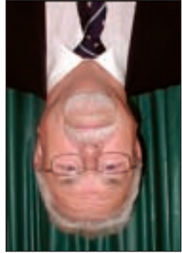
LORD MAGINNIS OF DRUMGLASS VICE-PRESIDENT, AUTISM NI (PAPA)

Nations Autism Partnership - hopefully working with our new Assembly to bring about change towards a more enlightened and vigorous policy in this field. why we are meeting today to celebrate the Northern Ireland Launch of the Celtic experience and focus necessary to spearhead the necessary policy change. That is is not accidental but rather because I see Autism NI with the vision, confidence, funding and creating a national strategy for Autism. My association with Autism NI compassion. It is time to work together - providing a better future; securing new we get action NOW. Shame at failure to do so will be a poor substitute for between Despair and Hope. Families falling into this gap are set to increase unless Autism and those who deal with ASD on a day-by-day basis has created a gulf by successive administrations to adequately enable children and young people with The importance of the work we are engaged in cannot be under-estimated. Failure