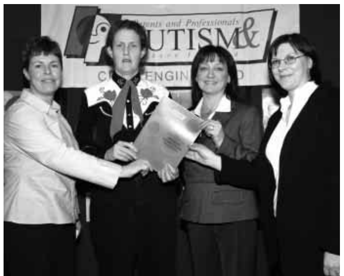
PAPA North Down & Ards meet Temple Grandin

Where they differ and what the choice must be based on is their outcome. TEACCH's philosophy, widely used in its literature is to make life meaningful for the person with ASD. The outcome for those with ABA is for " normalisation ". The former is concerned with how the person feels about the world and the latter how the world feels about him.